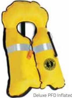
Deluxe PFD Inflated