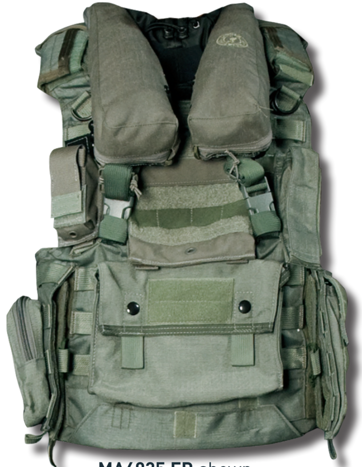
MA4035 FR shown

Each DTLP contains two inflatable cells. The cells are made from Radio Frequency (RF) welded, polyurethane coated nylon fabric. Pulling the beaded handles manually actuates the MD4035. Both cells incorporate oral inflation tubes. This provides a means to top-off or fill each bladder should